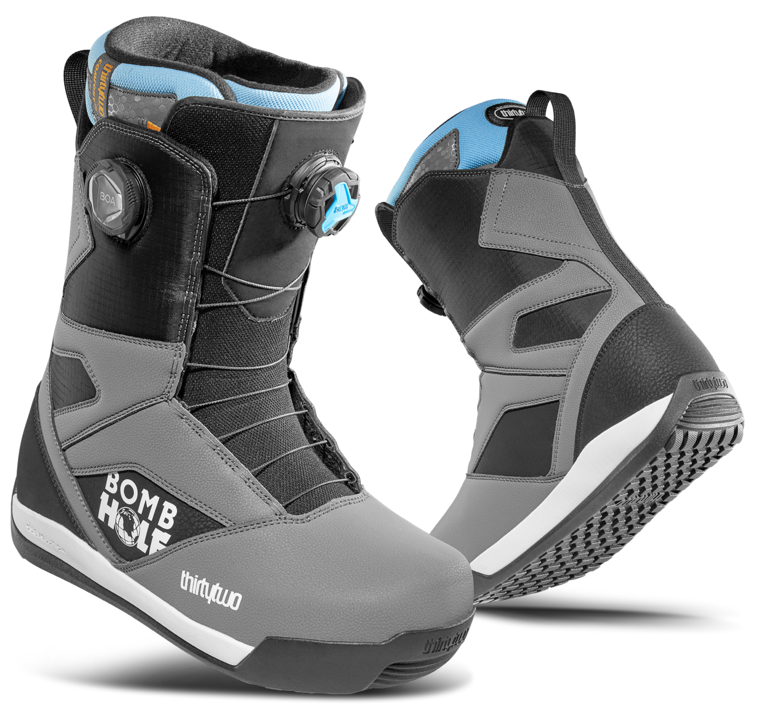
GRAY / BLACK