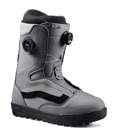
VN0A54G1HR0 Aura Pro