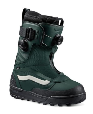
VN0A4UVDACW Verse Range Edition ¥ 62,000 / 24-Sep

This makes the Invado OG an easy choice for any rider looking for style and performance at an inc redible value.